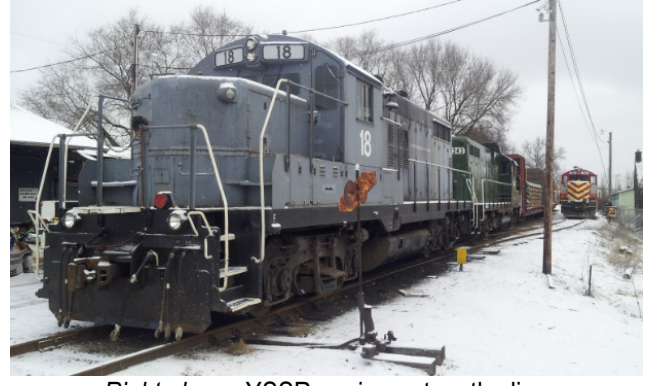
Left above: Youngstown and Southern Railroad depot on a snowy day. The next surprise – take a look across the street from the YSSR depot.. What hardware store has attached rail cars? Welcome to Crouse Mills Inc. a “True Value” (RM) store - hardware and more, much more.