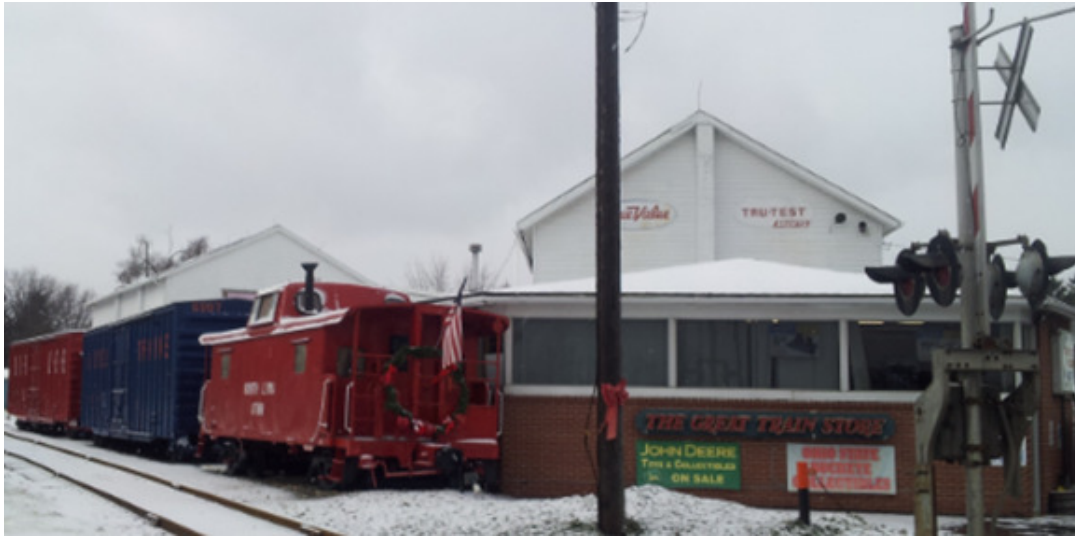
Above: Crouse Mills hardware and cars.

Tour the collection,, allow at least an hour to explore all the wonders. The first discovery is the beauty of the refinished rail cars that house the model train collections. Operating models pass overhead on two sets of suspended tracks. Glowing display cases abound, filled with vintage, gleaming Lionel train sets and more. Browse the aisles and displays, let the memories roll as your favorite lines and livery come to life.