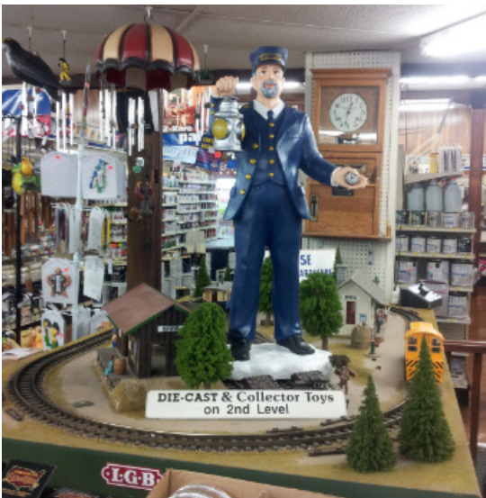
Left above: Trainman points the way. Right: Model display area in rail cars.

Tour the collection,, allow at least an hour to explore all the wonders. The first discovery is the beauty of the refinished rail cars that house the model train collections. Operating models pass overhead on two sets of suspended tracks. Glowing display cases abound, filled with vintage, gleaming Lionel train sets and more. Browse the aisles and displays, let the memories roll as your favorite lines and livery come to life.