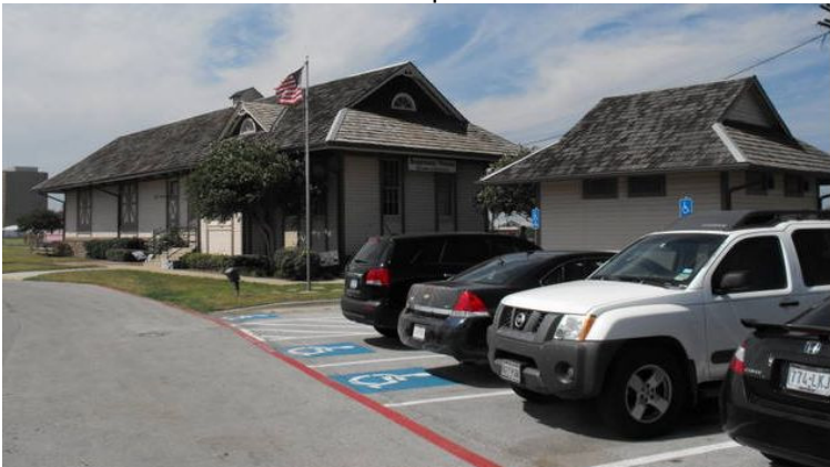
Above left: Saginaw depot.

The North Texas Chapter once again hosted this year’s “24 Hours @ Saginaw” at the former Houston and Texas Central depot, now the office of the Saginaw Chamber of Commerce. This year the event was co-sponsored by the Saginaw Chamber of Commerce and Choo Choo Express Trackless Trains.