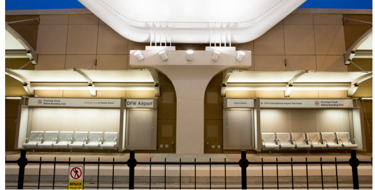
Right: Passenger platform at new DART DFW station