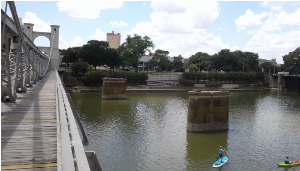
Above: Texas Electric Railroad bridge abutments and 1870 suspension bridge.